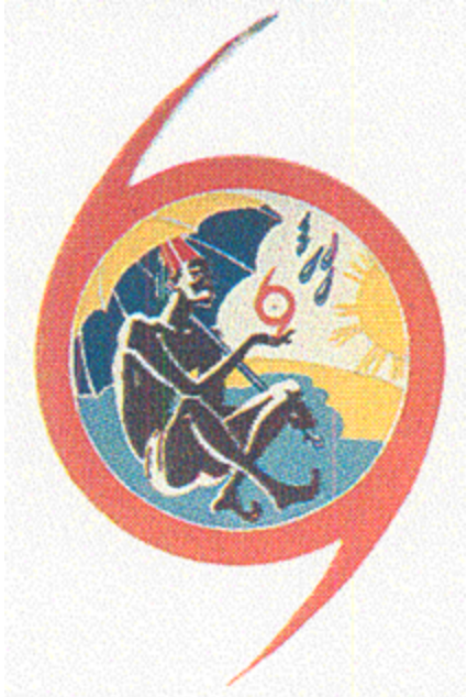
First emblem: approved, 4 May 1944.